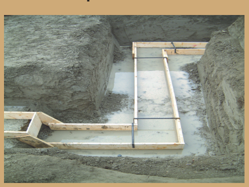
No Labour Intensive Site Work