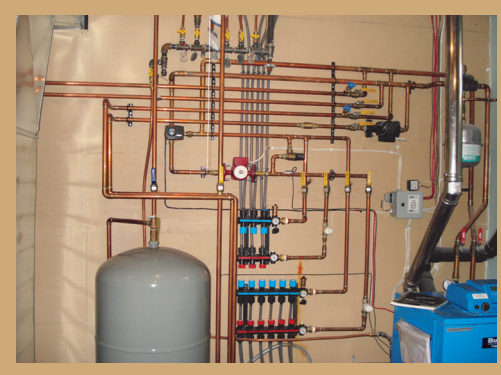
No Complicated Manifolds