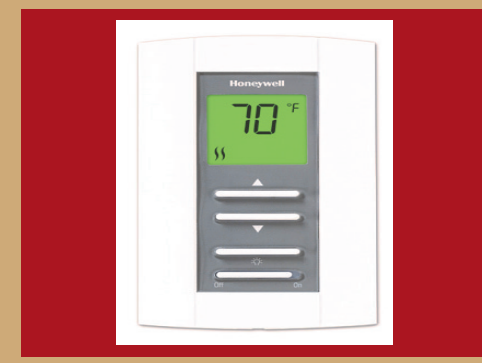
Simple "Worry-Free" Controls