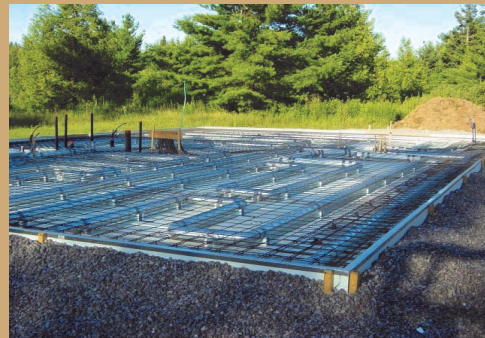
Footings And Frost walls Are Eliminated