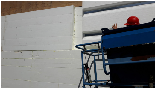
1. Place Panel