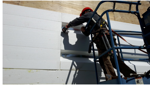
2. Screw the 4 corners first to position the panel