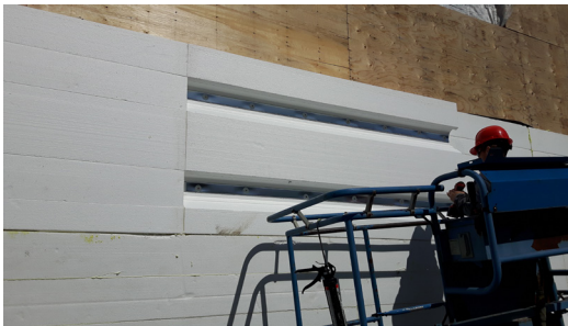
3. Install the rest of the screws