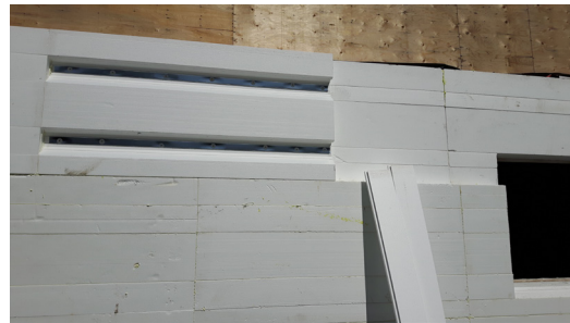
4. Installed Panel is ready for Snap Tracks