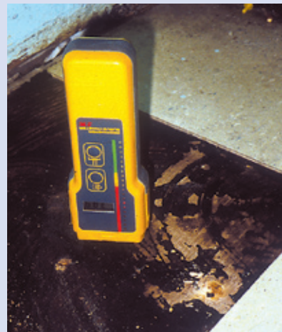
Photo 9: Moisture meter measuring moisture content of plywood subfloor