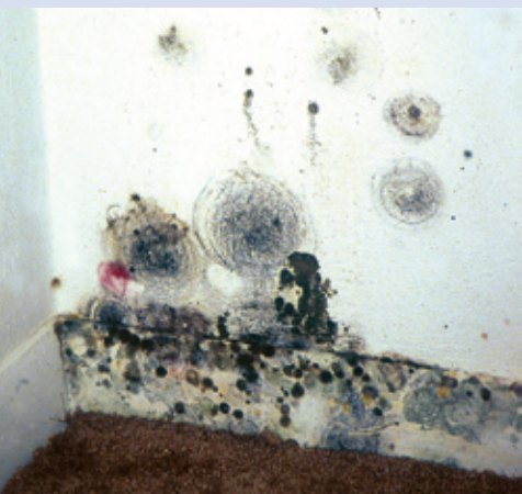
Photo 3A: Mold growing in closet as a result of condensation from room air